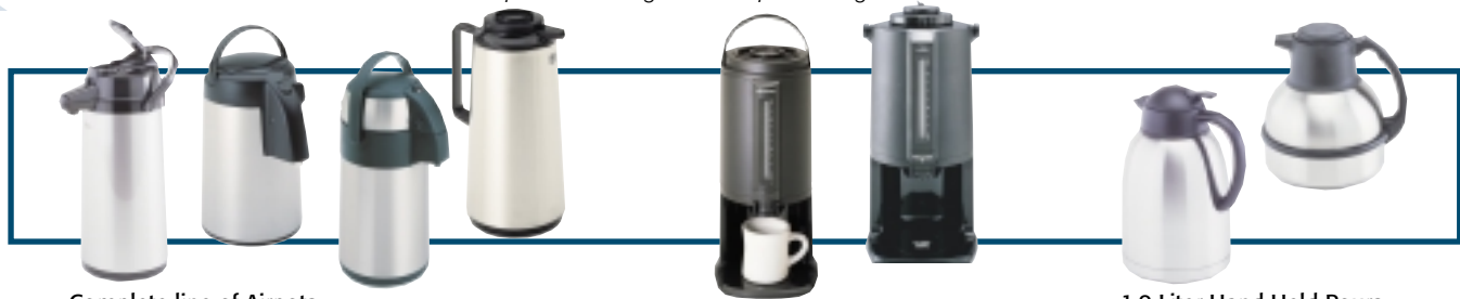
Complete line of Airpots for use with brewers with 13 3/8" clearance heights

ACCESSORIES: See the Bloomfield Brew product catalog for a complete listing of brewers and accessories.