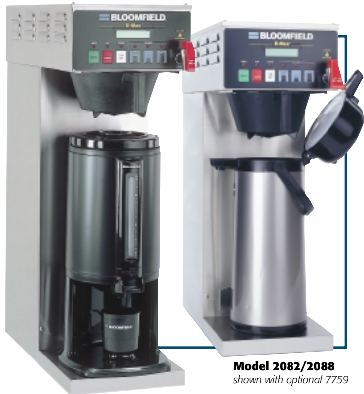
Model 2080/2086 shown with optional 7750